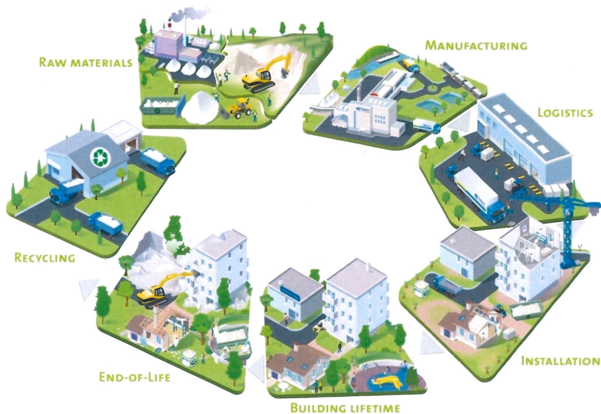
Flow diagram of the Life Cycle